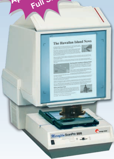
ScanPro 500 shown with combination fiche/aperture card carrier

ScanPro 500 Newspapers and Aperture Cards Full Size