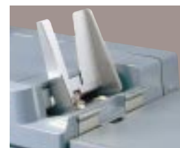
Option (Extension hopper)